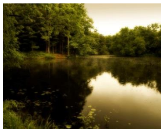
"Flint Pond, Tyngsborough"