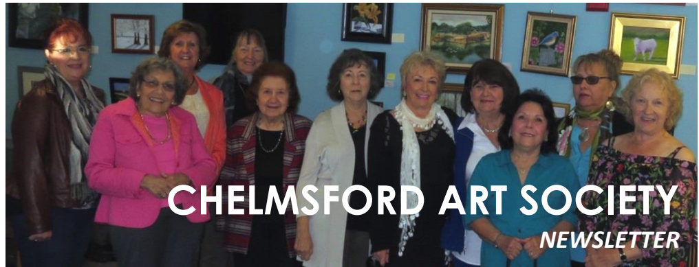
Photo taken at the 21 st Senior Citizen Art Exhibit, Boston