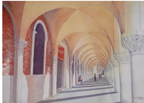
"Endless Arches II" Watercolor painting by Esther Donlon