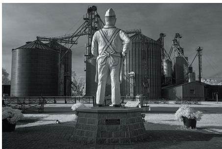
"Primary Source" photograph by Bruce Magnuson

Bruce Magnuson has a photograph in the Griffin Museum Show, "Primary Source", on display at Lafayette Place in Boston. The show is up now through March 24, 2020.