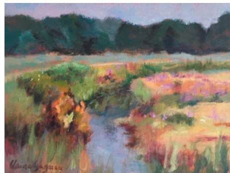
"Field of Dreams" was accepted into the Brush Art Gallery's Art Show. Exhibit dates are Dec. 7, 2019 to Dec. 23, 2019. Reception: Dec. 7, 2019, 2-4 256 Market St, Lowell, MA