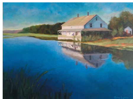
"Laundry Day" was accepted into the Rockport Association's National Fine Art Show. Exhibit dates are Nov. 23, 2019 to Jan. 1, 2020. Reception: Sat., Nov. 23, 2019, 2-4 12 Main St, Rockport, MA

Exhibit dates are Nov. 16, 2019 to Jan. 25, 2020. 243 Worthen St, Lowell, MA