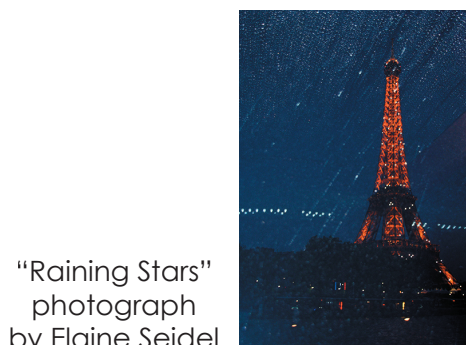
"Raining Stars" photograph by Elaine Seidel

Elaine Seidel will be exhibiting two of her photographs, "Raining Stars" and "Knowledge is Power, Library of Congress" in The Brush Juried Members Show; and "Curiosity" in the Rockport National Show.