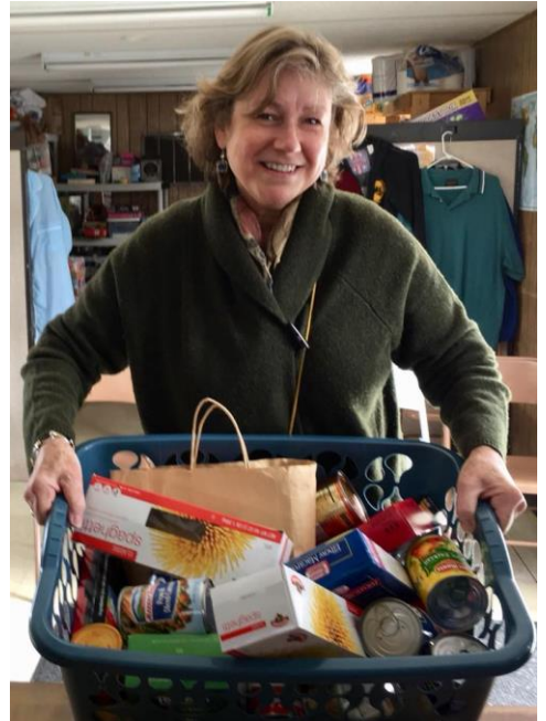
Chelmsford Art Society members donate generously to the Food Pantry!