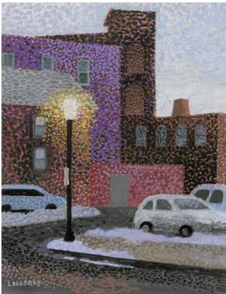
"Twilight on Jackson St."

This painting is on exhibit at the gallery.