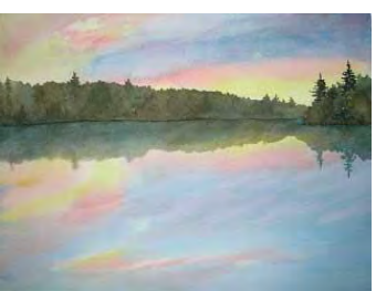
"Sunset on the Pond" by Esther Donlon

If you haven't seen them yet, please remember to visit the beautiful watercolors by Esther, on display until the end of February!