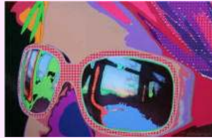
"Sunglasses at Night" digital art by Tracy Newman.

Tracy Newman will be displaying her Digital Art through the month of April. Tracy's art display involves digitally manipulating her photographs in an artistic way creating colorful digital art/photography.