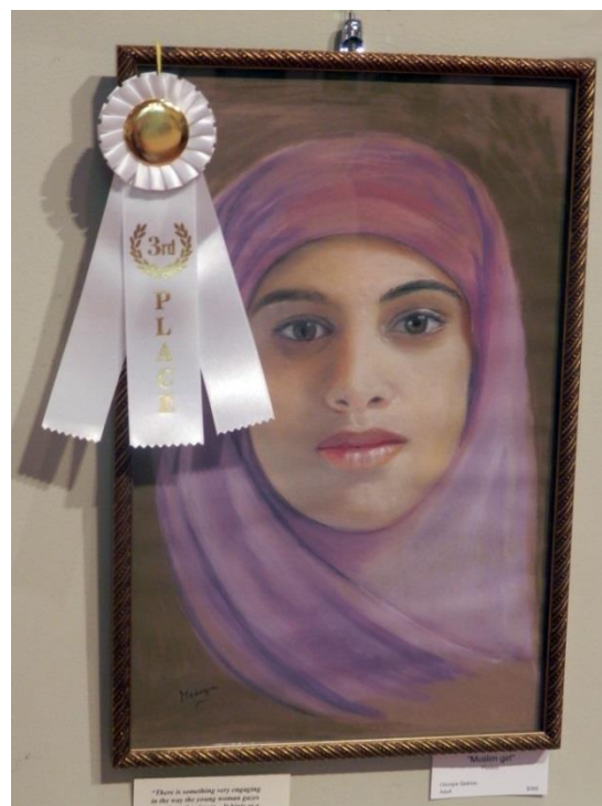
"Muslim Girl" pastel drawing by Georgia Spanos