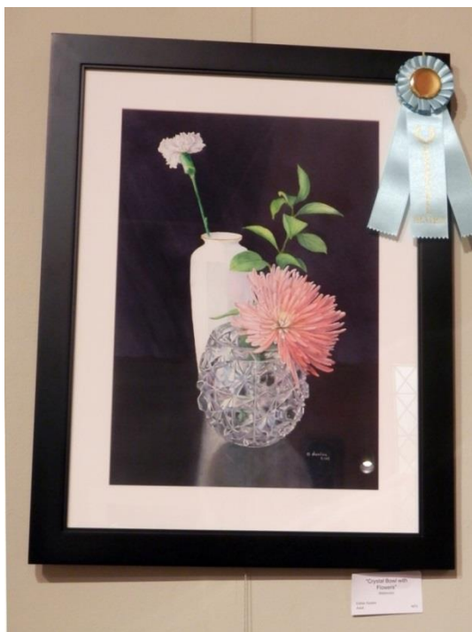
"Crystal Bowl with Flowers" watercolor painting by Esther Donlon