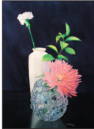
"Crystal Bowl with Flower"