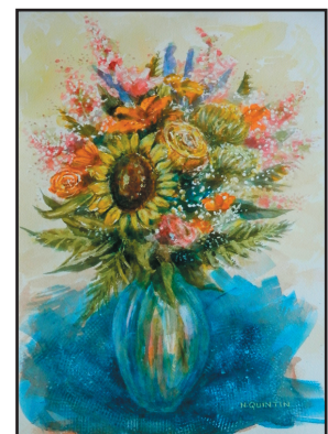
"Bouquet with Sunflower" watercolor by Nan Quintin

https://artscopemagazine.com/home/covid-19-online-art-resources/