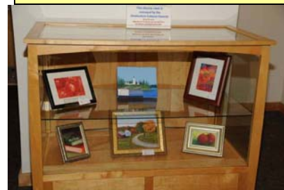
Artwork at December Library Show