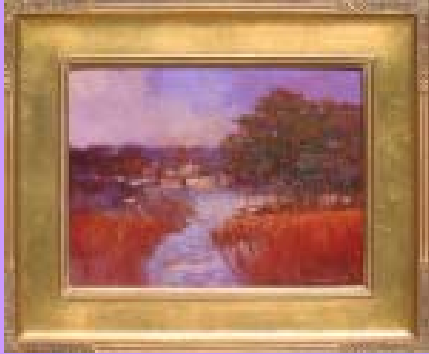
"Winter Blues" oil painting by Monique Sakellarios

The Chelmsford Art Society is featuring Monique Sakellarios who will demonstrate Oil Painting . The artist creates paintings of landscapes, gardens and market scenes in the impressionist style.