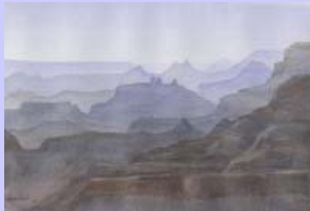
"Grand Canyon" by Esther Donlon

The Summer Place 20 Summer Street, Chelmsford: