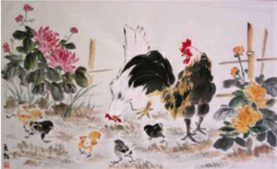
"Happy Family" by Yahong Shen