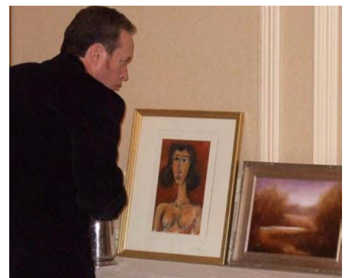
An interested patron looks at the art on display at this year's Silent Art Auction at the Radisson hotel. MORE photos on the back of the insert.

Publicity Needed! CAS Board is looking for a marketing person for all our events. If this sounds like something you'd like to try, please call Claire Gagnon at 978.957.5058.