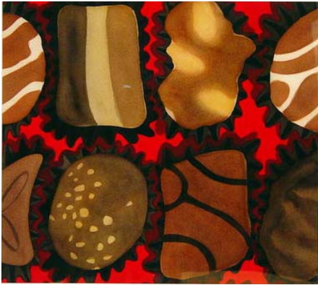
"Chocolate Ensemble" by Crist Filer