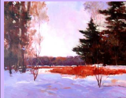
"Now All is Still" by Monique Sakellarios

Monique Sakellarios will give a Demo at Gallery One, Nashua on Wednesday, May 6, 7 to 9pm. The demo is free to the public. Monique will be demonstrating her unusual oil painting technique. For Gallery One directions go to www.naaasite.org . It is located at 5 Pine street extension in Nashua.NH. Phone: 603-883-0603.